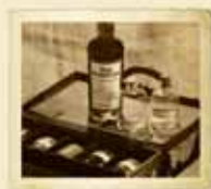
GEORGE GARVIN BROWN'S Original Sample Case

IN 1870, GEORGE GARVIN BROWN INTRODUCED AMERICA'S FIRST BOTTLED BOURBON.*