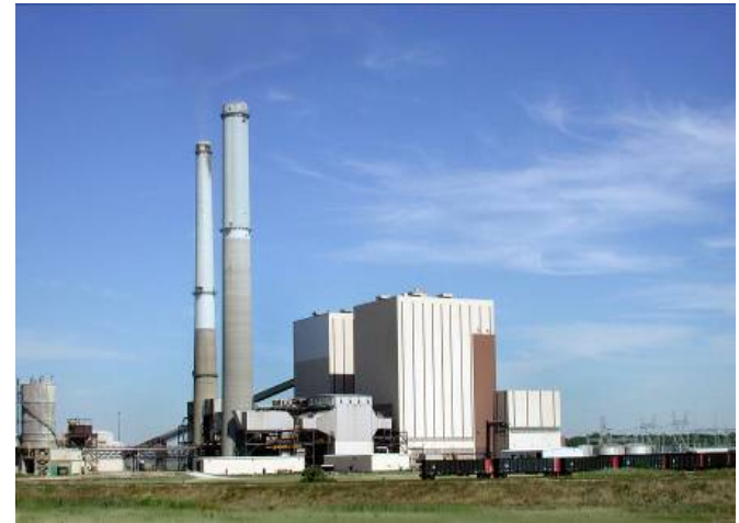
Non-rate-regulated Coal-fired Generation