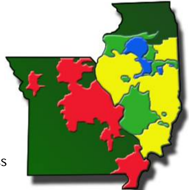
Ameren Service Territory